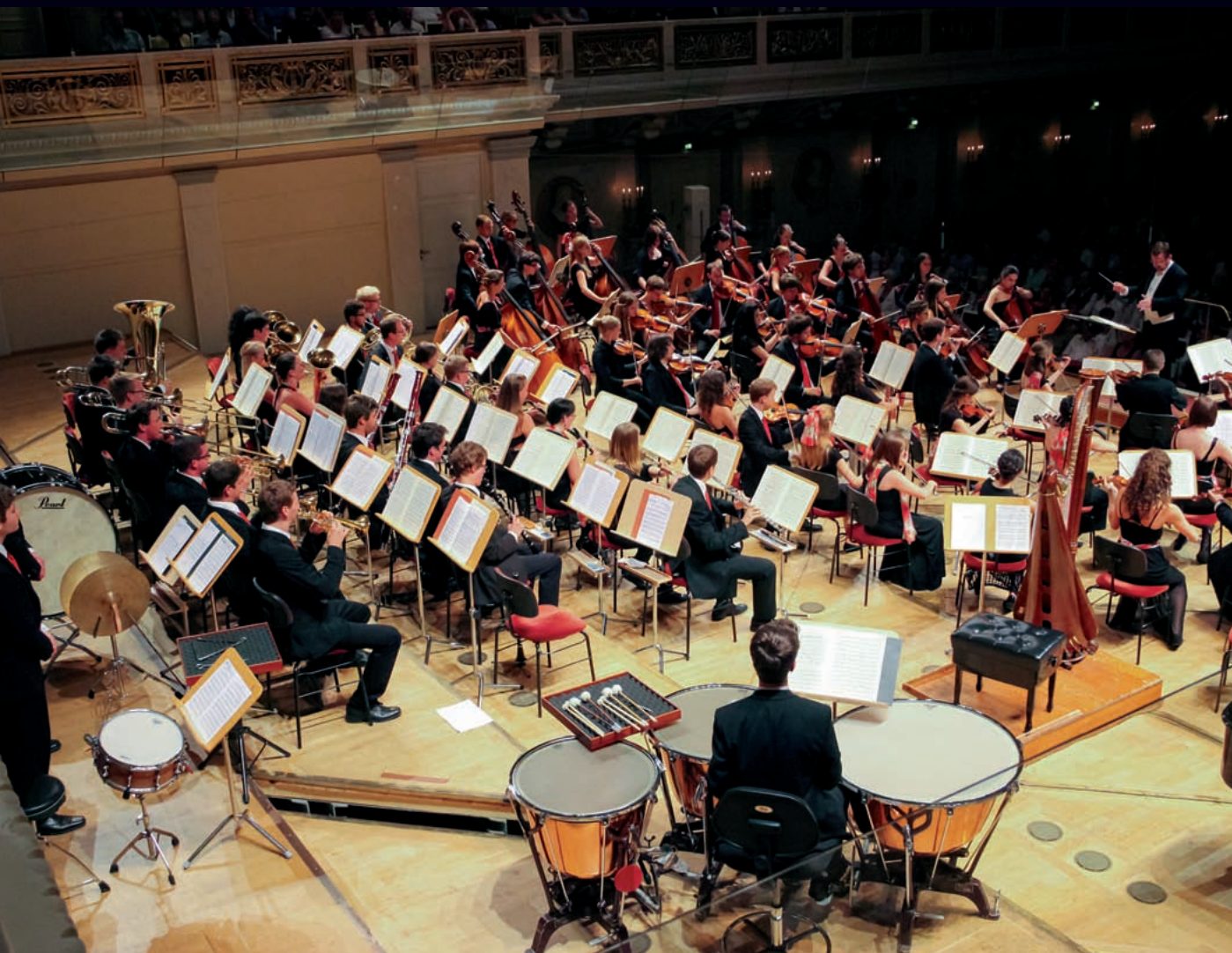
Wiener Jeunesse Orchester at Young Euro Classic, Konzerthaus Berlin, August 2013, welcoming MusXchange musicians from France, Spain, Romania, and the Netherlands