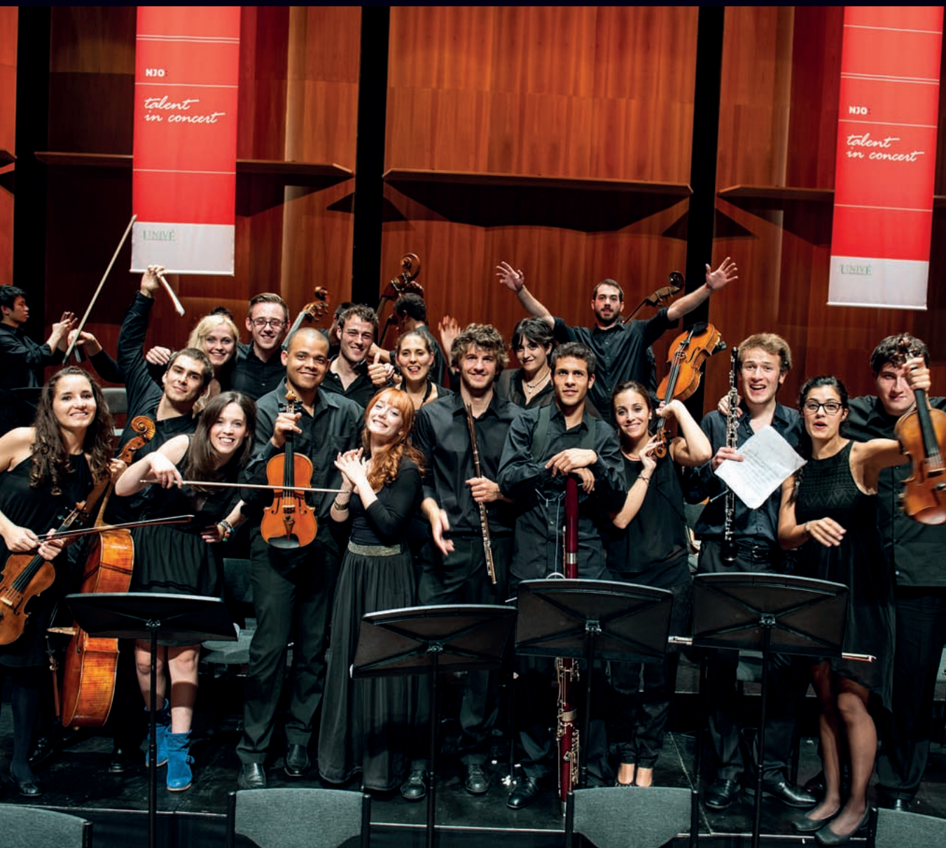
NJO: talent in concert (Nationaal Jeugd Orkest), August 2013, welcoming MusXchange musicians from Poland and Spain