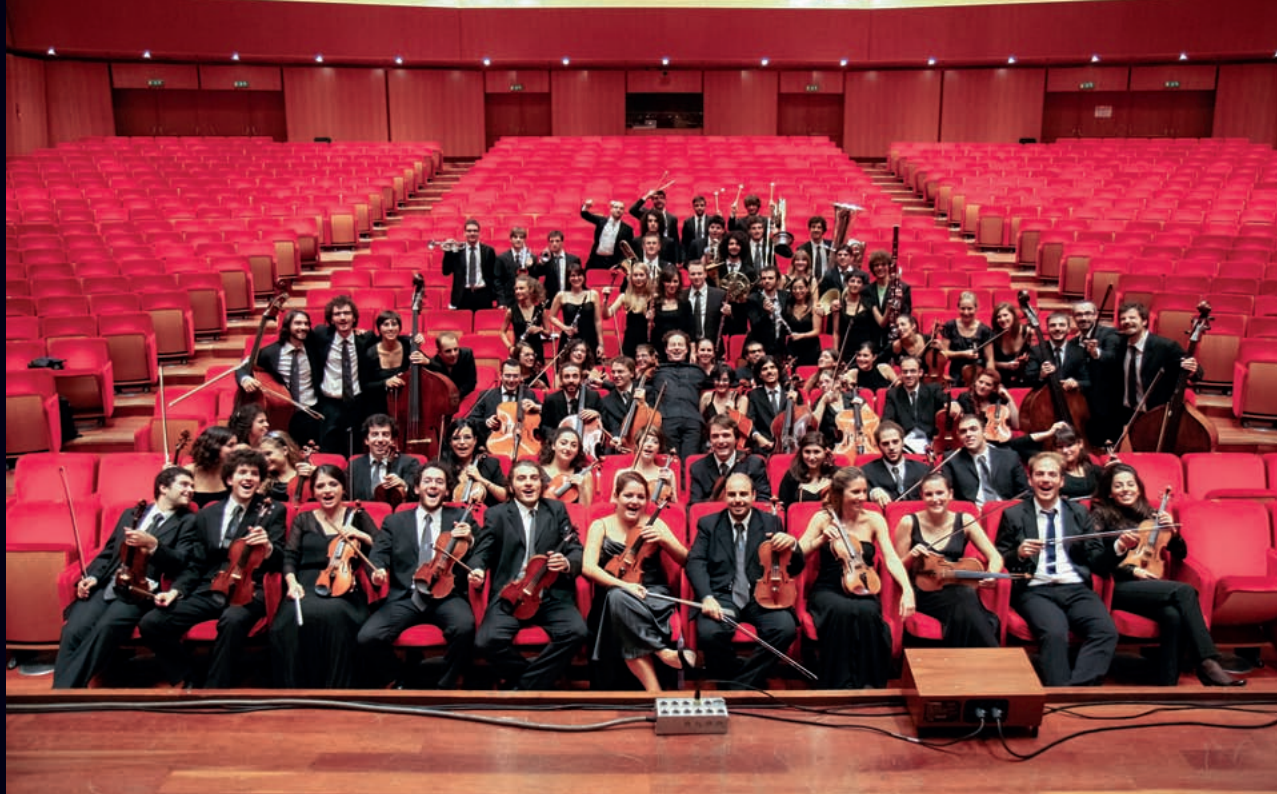
Orchestra Giovanile Italiana at the Auditorium Parco della Musica di Roma, October 2012, hosting MusXchange musicians from Austria, Spain, and Lithuania

For me, it was a wonderful experience that was organised well and that I still carry with me. I wish to thank those who made the effort necessary for the conception, development and sustenance of this marvellous project. Grazie MusXchange!