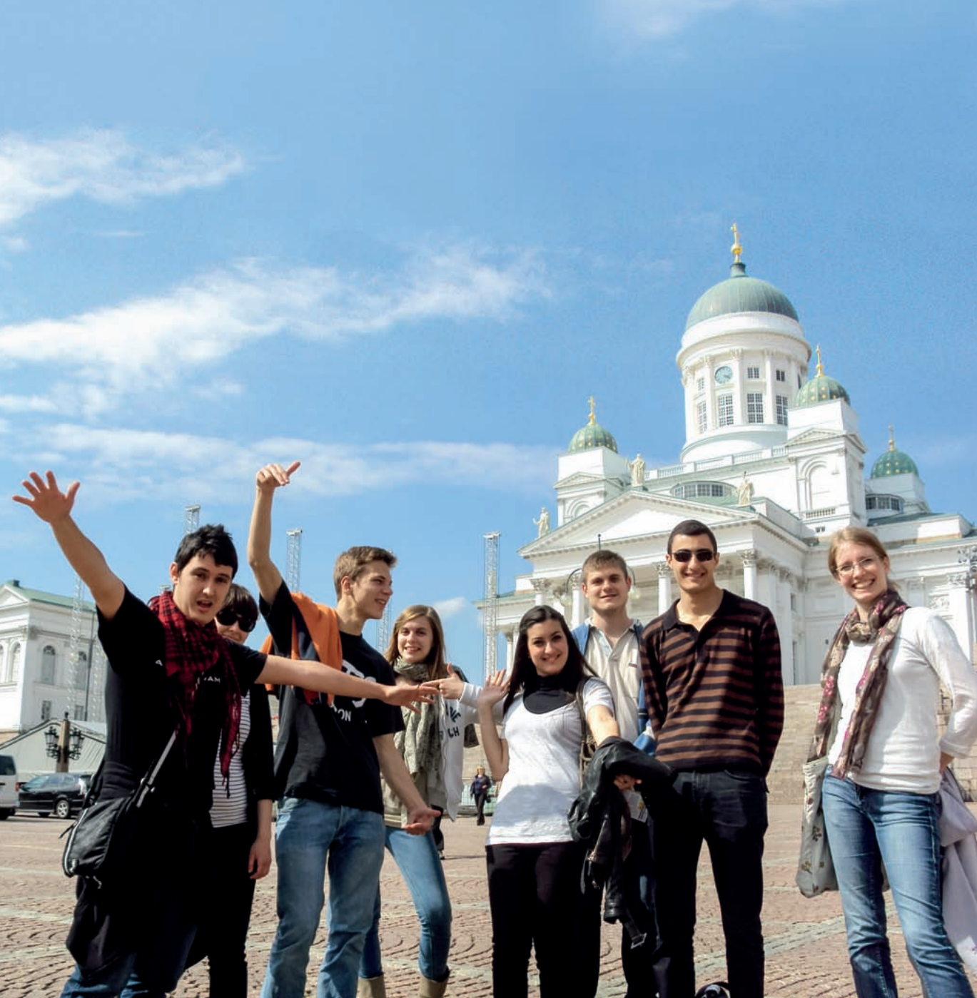
Sibelius Academy Symphony Orchestra, May 2012, welcoming MusXchange musicians from Austria, France, Spain, and Poland in front of the Helsinki Cathedral

At the occasion of the official launch of the MusXchange Programme 2012-14, the Sibelius Academy Symphony Orchestra was fortunate to receive eight enthusiastic guest players from Spain, Poland, Austria and France. The symphonic programme for this special event included Magnus Lindberg's "Clarinet Concerto" and Richard Strauss' "Alpine Symphony" under the baton of Leif Segerstam. Naturally, it was a major challenge for all players, and a great experience for them to play in the magnificent concert hall of the new Helsinki Music Centre (Musiikitalo). The MusXchange musicians also had the opportunity to join orchestra managers for discussions on future perspectives of the music profession in the framework of the General Assembly of EFNYO hosted at the Sibelius Academy.