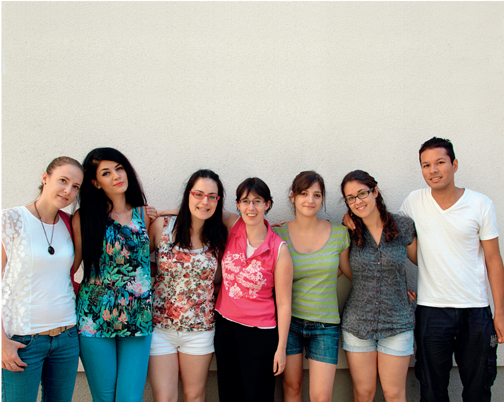
Wiener Jeunesse Orchester, August 2013, hosting MusXchange musicians from Romania, Spain, France, and the Netherlands

Continue this way! MusXchange gives people the chance to travel, learn and share experiences on different cultures and orchestras. One learns to be tolerant, and to play together with people who have different views, which is the best way of growing as a person. The conductor, the soloist, the staff and the composer were really involved in looking after the atmosphere in the orchestra. All the exchange musicians were very well received, and the integration was perfect. Not only during the rehearsals, but also during our free time. Thank you again for this opportunity!